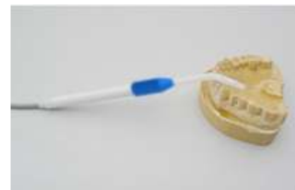
Relation of proportions